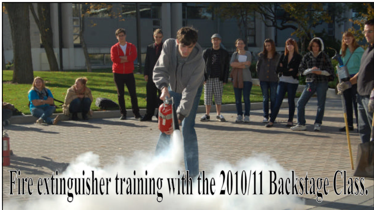
Fire extinguisher training with the 2010/11 Backstage Class.